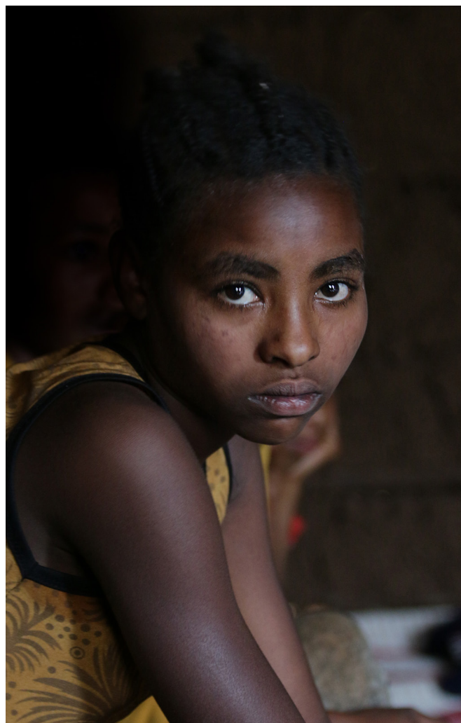
Eldest daughter of widowed and destitute Christian mother, southern Ethiopia.

Government armies, militias and criminal groups exploit Christian children and youth in conflict zones as commodities. They are shaped into child soldiers ( see page 10: Gender and CSRP-YSRP ), or bought and sold as products trafficked for