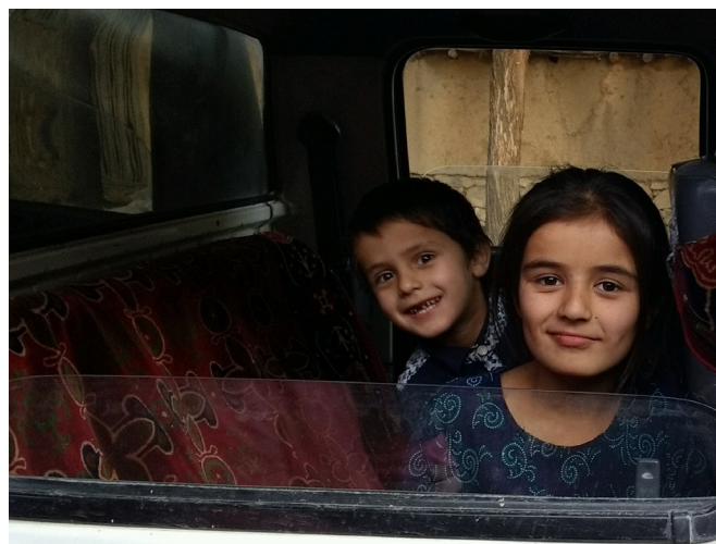
A young boy and girl in Afghanistan.

When analyzing the top 10 Pressure Points for 2021, three words synthesize the characteristic challenges