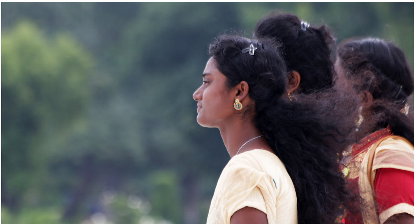
Teenage girls in Northern India.

As seen in Chart 2, Forced marriage and Violence - sexual were the two most widely reported Pressure Points for girls across the WWL 2021 top 50 countries. Affiliated Pressure Points such as Abduction, Trafficking and Targeted seduction also contribute to a pattern of targeting girls for their sexual purity and marriageability. Girls are usually fully dependent on family for financial and physical security and thus highly vulnerable should persecution come from within their family unit; escape is rarely an option.