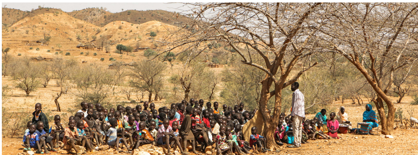
A class of students in Sudan.

a parent's Christian conversion, courts may automatically take away custody of children based solely on a parent's faith. Alternatively, extended families remove children from Christian parents, a practice accepted by communities due to embedded social norms. tates can exert further power over Christian parents: similar to the administration challenges churches face in the region, Christian parents with an Islamic background can often struggle to register children. 21 Chart 1 shows this in the high percentages for Denied access to a Christian parent and Denied legal identity as a Christian.