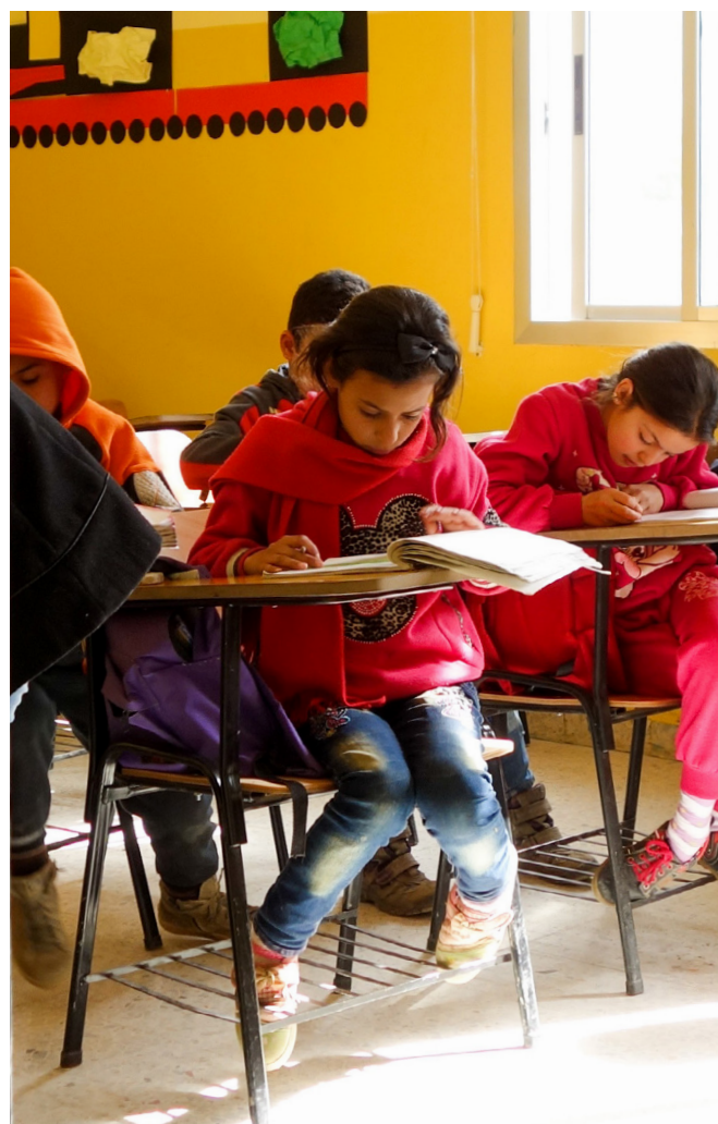
Class with Syrian children.

Four of the associated Pressure Points comprise different forms of violence (verbal, sexual, physical, and psychological) in addition to the discrimination inherent in Denied access to social community/ networks (children and youth shunned by classmates). Education has the power and potential to create cultures of tolerance and understanding, but equally, can “fuel stereotyping, animosity” and “entrench disadvantage”. 30 Carried out primarily by peers and teachers, an enabling environment often ignores, or worse, actively encourages such activities. Harassment of Christians may be seen as legitimate or even unremarkable, and so, these Pressure Points can be carried out with relative impunity.