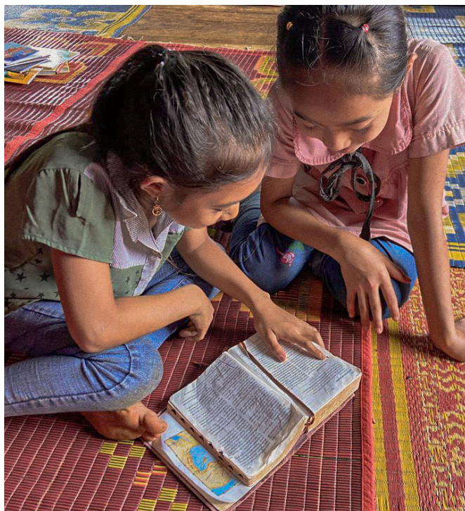
Girls reading the Bible in Laos.