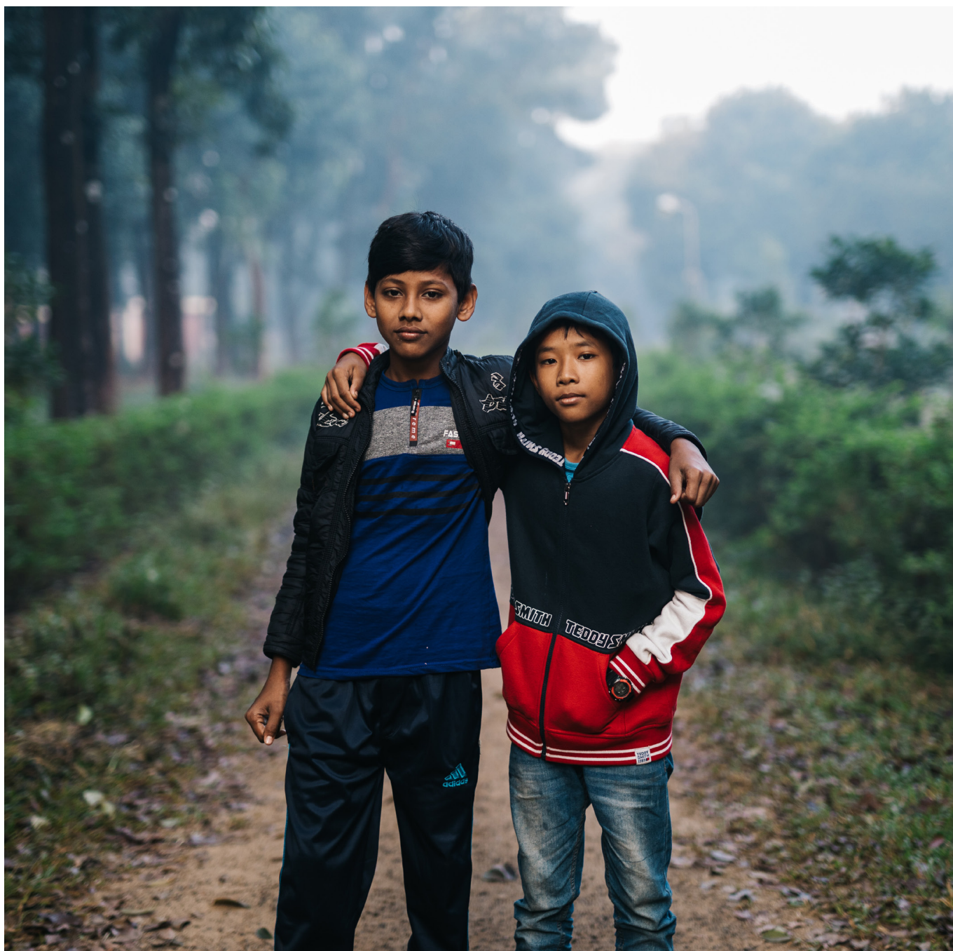
Christian boys of Muslim background in Bangladesh.

in many countries where Christians are persecuted, with persecuting actors ranging from family members to peers to violent groups. Generally, this is motivated by those of majority religions or ideologies aiming to pressurize conversion, either to put pressure on relations, or using violence as a response to the rejection of the majority religion or belief. Yet sometimes there are specific triggers for violence, as in parts of Syria and Egypt, where witnesses reported that perceived immorality in the way Christian girls dress results in physical abuse. More commonly, the trigger is the refusal to renounce their faith or participate in the activities of violent groups.