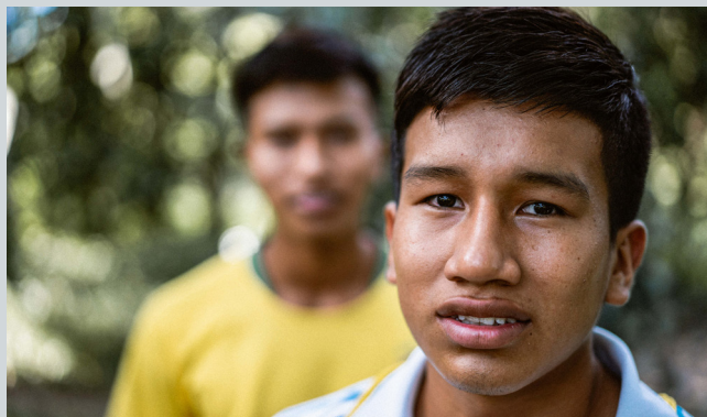
Young boys from the Nasa-Páez indigenous community in Colombia.

When a child's path for education is restricted, it statistically leads to reduced socio-economic status. 49 As noted above in Spotlight: Education (see page 8), such restricted paths often lead to other vulnerabilities such as child marriage, trafficking and physical violence.