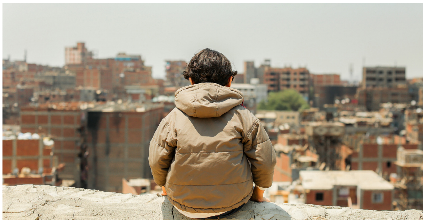
A young Egyptian boy watching over his city.

Recognizing the end goals of CSRP-YSRP and the risks can encourage LFAs and policy makers to work together to ensure the broadest space of religious freedom for children and youth as they grow into their own unique spirituality. Policy makers can ensure that the intersection of children’s rights with religious faith (or belonging to a family with religious faith) is recognized as an additional vulnerability. Together, adults committed to religious freedom can work to preserve the opportunity for children and youth to learn and grow in the faith of their parents and the child’s right to and developing capacity to explore freedom of religion or belief.