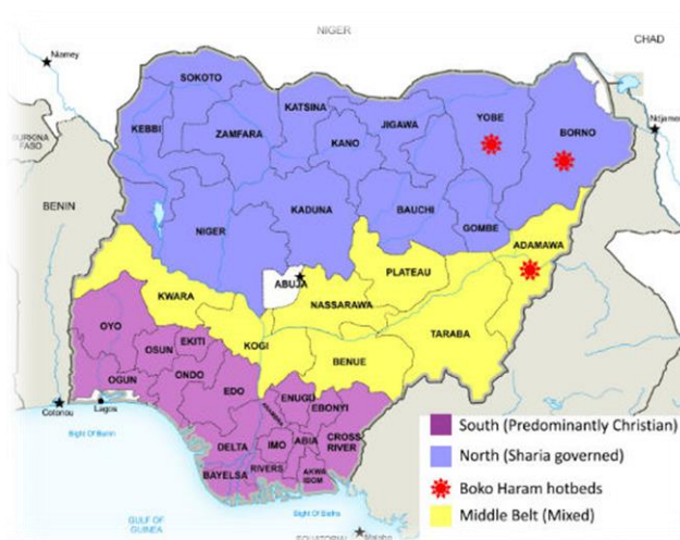
Figure 1: Map of Nigeria showing Sharia states and Boko Haram hotbeds Note: In Yobe, Borno and Gombe states, Sharia applies in personal status issues only; in the other northern states Sharia is fully implemented, also in criminal law.

With a population size of 195,875,000, 6 Nigeria is the largest on the African continent and notably diverse with about 200 ethnicities and 500 languages. It is one of the key players in worldwide oil production and is familiar across Africa for its sizable media market.